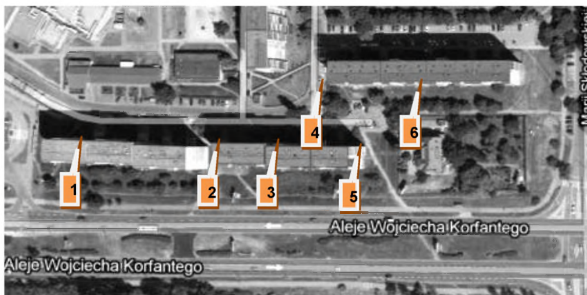
Fig. 11.1 Satellite view from Google Maps Avenue W. Korfantego with marked test points