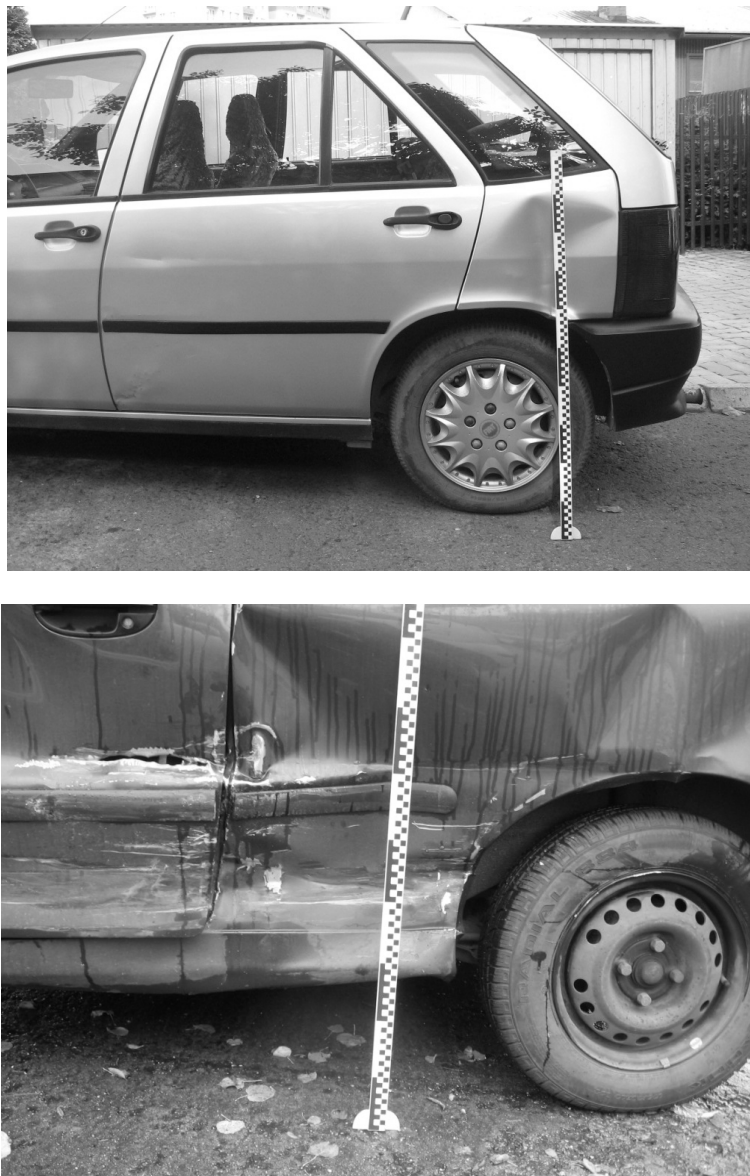
Fig. 1. The example photo documentation of the vehicle damage Rys. 1. Przykładowa dokumentacja zdjęciowa uszkodzeń pojazdu