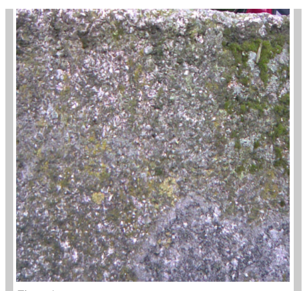
Figure 1. Concrete foundation covered with different lichens