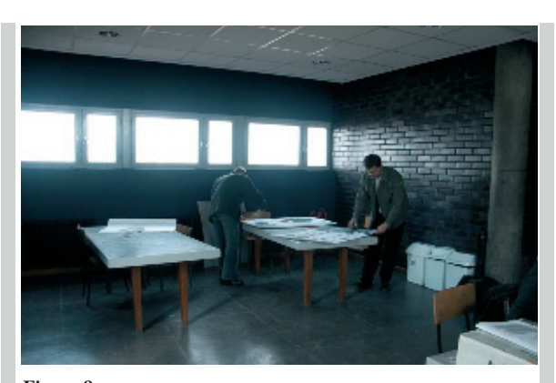
Figure 8. "Students' space" for preparation in Gliwice Faculty Building