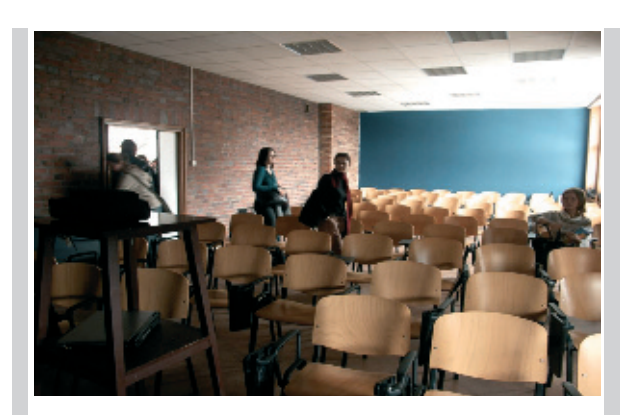
Figure 3. One of small lecture rooms in Gliwice Faculty Building