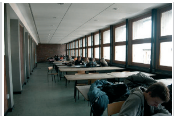
Figure 4. The "long" classroom in Gliwice Faculty Building