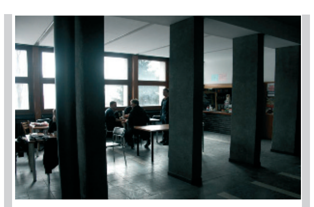
Figure 7. Canteen in Gliwice Faculty Building