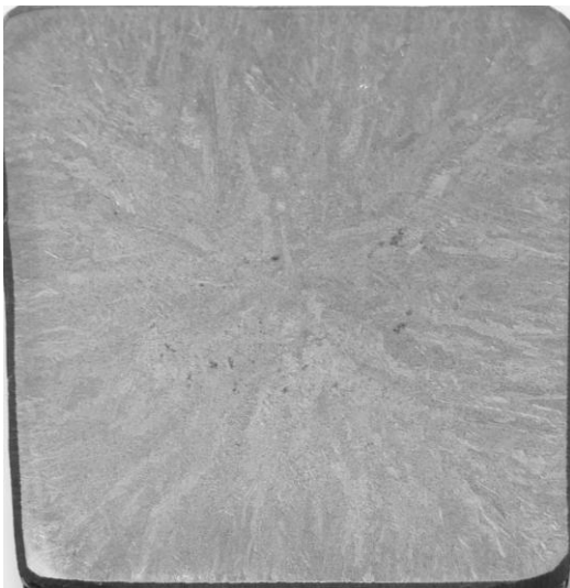
Fig. 3. Macrostructure of sample casting no 3_2