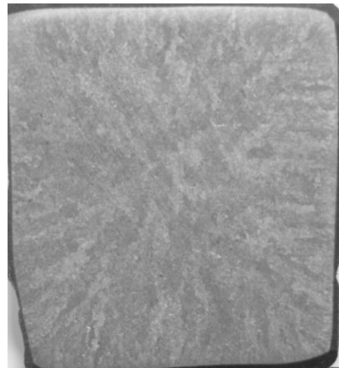
Fig. 4. Macrostructure of sample casting no 2_2