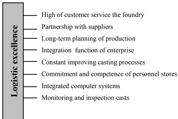
Fig.1. Features „excellence” logistic foundry [10]