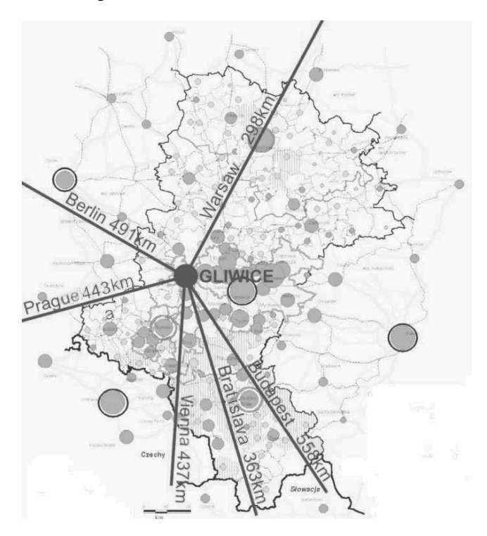
Fig. 1. Gliwice town compared to Silesian Province and its distance to capital cities of European countries

There is the headquarters of project executors in Gliwice situated in Silesian province at the technical university being the biggest one in Silesia and one from the biggest technical universities in Poland. The university entity responsible for the FORSURF project realisation is the Institute of Engineering Materials and Biomaterials belonging to Faculty of Mechanical Engineering of the Silesian University of Technology. The Institute of Engineering Materials and Biomaterials is the biggest in the country scientific-research entity specialised in the field of engineering materials and biomaterials. The Institute owns the large laboratory included several dozen of factual entities. That laboratory has high research potential and unique character both in the country and abroad. About investment attraction of Silesian Province decide the following factors [8]: