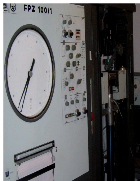
Fig. 1. The test stand

changes in the diameter – runs with values of <1 and changes in the length – runs with values of >1 . Dimensions of the test section of pipes are given in relative values – the initial diameter of the external pipe ( D = 63 \pm 1,5 mm) and the length of the test section ( L = 50 \pm 1 mm). The first time interval (0 – 3 min), during which the pipe lengthens and its diameter reduces, corresponds to the pipe drawing phase, that is load applied with an axial force. In the remaining measurement period the pipe was not under any load.