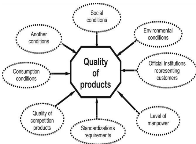
Fig. 1. The factors forming quality products requirements [7]

Fulfillment of customer's requirements is closely connected with delivering them the products of the highest quality. In order to preserve and increase quality level of products, the producers should take measure this quality, control it and try to improve it. Such activities should take place on every stage of existence of the product and technology; from the moment of market researches and projecting, and until its removal market [1, 6]. The correct quality control, which makes it possible to create satisfying products for customers, has take into account many factors. These factors were shown schematically on figure 1 [7]. The synergetic influence of presented factors shapes the final level of product quality. However this influence is not equal on every stage of product life cycle. Depending on considered phase of product life cycle or technology life cycle the different factors have dominant impact on quality, and this the function of company changes in process of product quality forming [5, 7, 8]. The organization can take leading function in this process, as it has during designing, production and delivery of products to customer, or it can play only helping function realized on stages of use, exploitations and of the removal product [7].