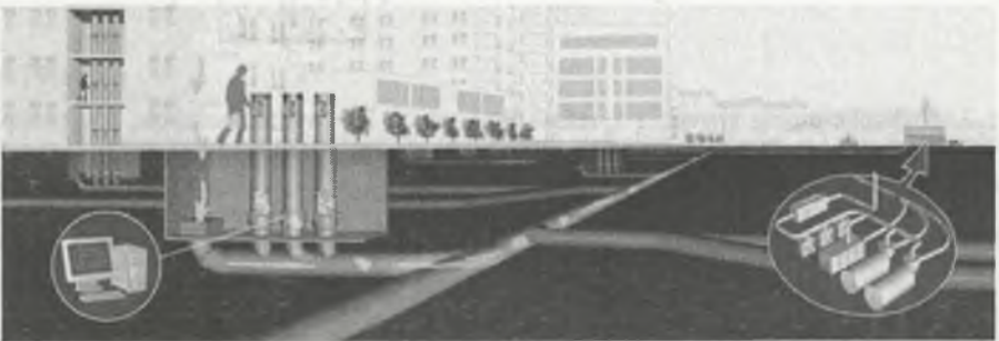
Fig. 2. Vacuum waste collection [5]

Transport waste in containers – the system is in use for long distances. It demands building of charging and unloading stations [4].