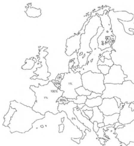
Fig.2. Expected implementations of ETCS till 2008

The map below gives a general overview where and to what scale we may expect the ETCS until the end of 2008.