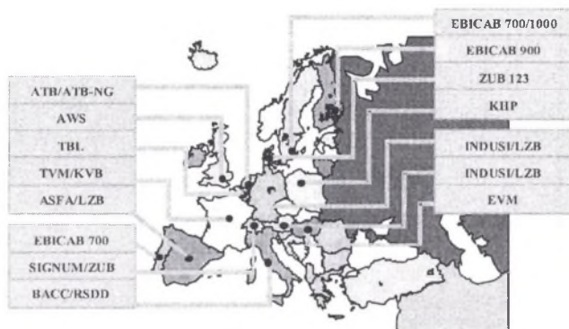
Fig.1. Railway traffic control systems