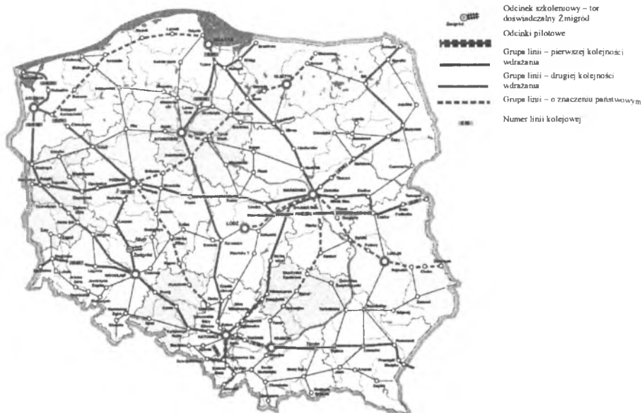
Fig.5. Order of ERTMS implementation on PKP lines