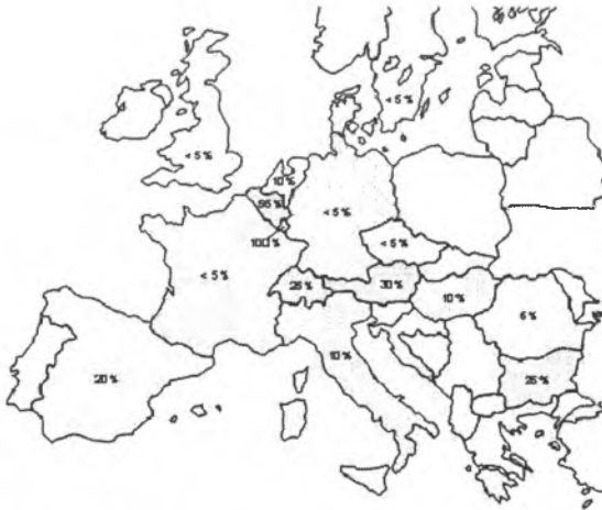
Fig.3. Lines to be provided with ERTMS till the end of 2008

The map presented on Fig.3 gives a general overview where and at what scale the ETCS may be expected till the end of 2008.