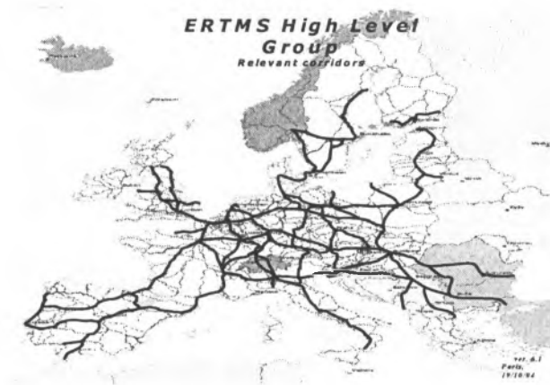
Fig.4. Transport corridors planned for priority installation of ERTMS

Fig.4 presents a general strategy supported by EU (both for high speed and conventional lines) of ERTMS/ETCS implementation and concerning passengers' or cargo for which the ETCS may be used.